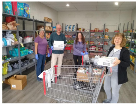
SYBA food pantry at 1431 Front Street, Statesville is providing food assistance by drive thru appointment Wednesdays 10 am - Noon.

SYBA Clothes Closet is closed permanently.