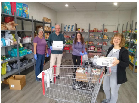
SYBA food pantry at 1431 Front Street, Statesville is providing food assistance by drive thru appointment Wednesdays 10 am - Noon.

SYBA Food Pantry on Amity Hill Road. Food is available by appointment.